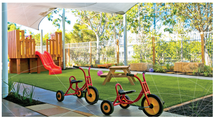
Petit Early Learning Centre, Caloundra, Queensland

For the quarter ended 30 June 2015, a distribution of 2.55 cents per stapled security has been paid. This brings the total distribution for FY15 to 10.0 cents, in line with previous guidance. For the quarter, 20.6% of securities on issue participated in the DRP at an issue price of $1.5392 per security. As a result 776,595 new securities were issued with distribution entitlements effective from 1 July 2015. The issue price was based on the average daily volume weighted average price (VWAP) over the period 2 to 22 July 2015, less a pricing discount of 1.5%.